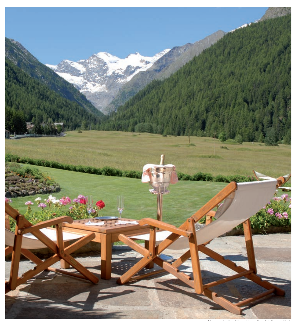
Coone in the Gran Paradiso National Para

Prices from £2,390 per person based on two people sharing a double room.