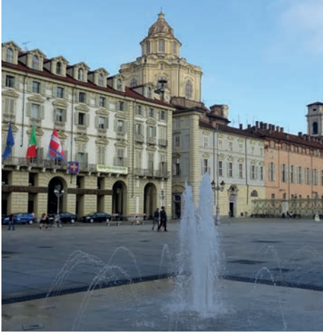
Piazza Castello, Turir

Official category 5-star Open All year Location Central Turin