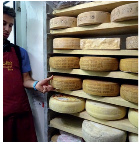
Giolito cheese shop in Bra