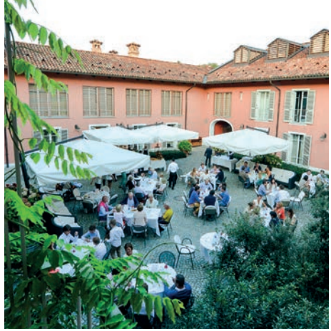
Villa d'Amelia, courtyard

Official category 4 star Open 12 April to 31 December Location Benevello, near Alba Distances in miles Alba 9, Turin 54 Nearest airport Turin