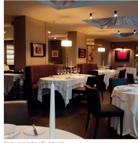
Restaurant at the Villa d'Ameila