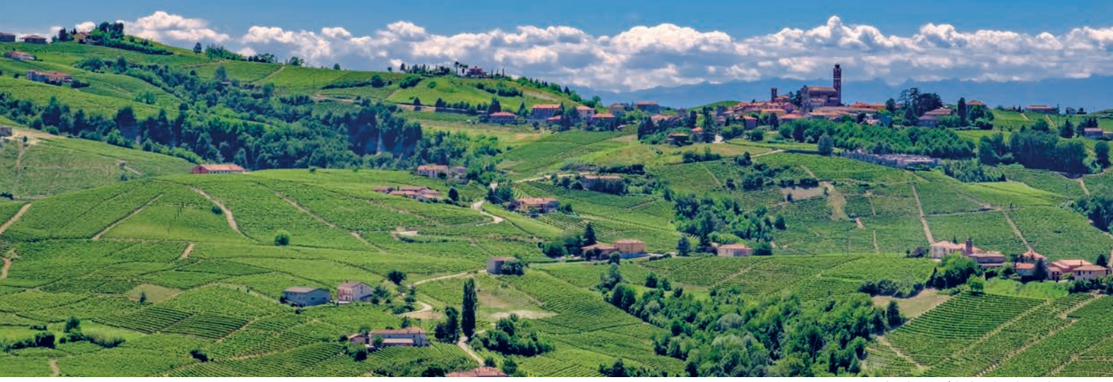
Landscape of the Langhe wine region