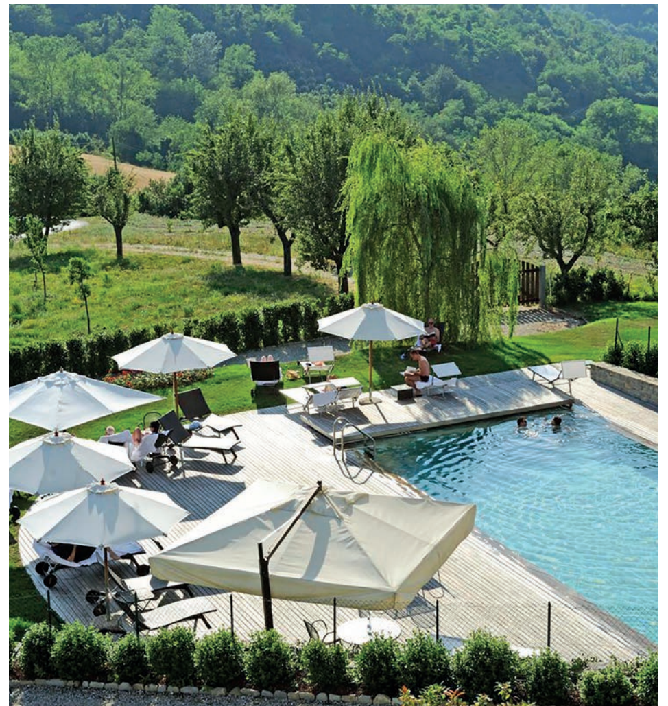
Villa d'Amelia, swimming pool in summer

Nestling amongst 7 acres of hazelnut groves and parkland, the 4-star Relais Villa d'Amelia is a charming renovation of an 18th century estate in the Langhe which offers seclusion and breath-taking views of the Monviso Alps. In its transformation from estate to hotel, Villa d'Amelia has not lost its traditional features, so communal areas have exposed beams and tiled floors, offset by contemporary furnishings and comforts. The hotel's 37 rooms and suites are individually decorated in warm, yet neutral colours but with striking charcoal accents. Four poster beds in most suites add an extra element of luxury and romance, while families may be best-suited to the interconnecting superior rooms. The hotel's Wellness Centre has a fitness area, Turkish bath, Finnish sauna, whirlpool, and heated outdoor swimming pool. Guests will find gastronomic finesse in the hotel's Michelin-starred restaurant, which serves modern interpretations of local cuisine. The bar offers a taste of the region through its selection of delicious wines and cocktails. The white truffle town of Alba is about 20 minutes' drive away and the vineyards of Barolo are about 30 minutes' in one direction and those of Barbaresco about 20 minutes' in the other direction. In the autumn, search for truffles in the wooded landscape, or, all year round, wander through Piemonte's wine cellars.