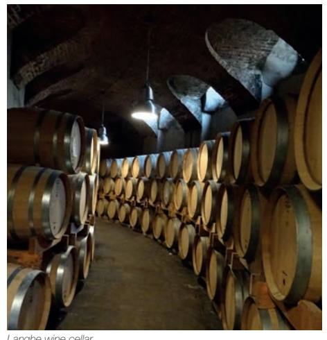
anghe wine cellar