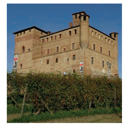
Castle of Grinzane Cavour